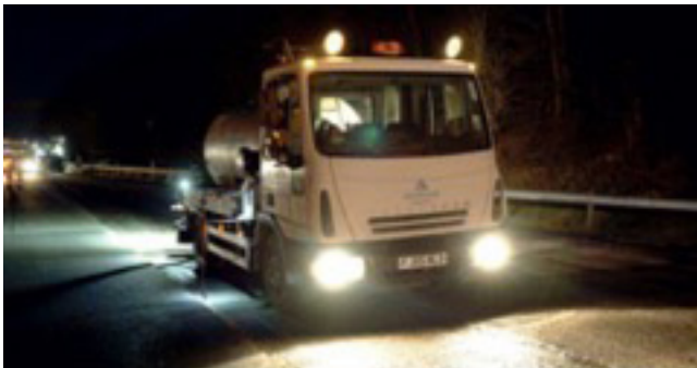
Automated joint sealing: reduces need for isolated working & potential for pedestrian/plant interaction

Vehicle and pedestrian segregation must be effective and should include; one-way systems; barriers; vehicle movement management plans; segregation of light and heavy vehicles and pedestrians; safe pedestrian crossings; and the need to reverse should be eliminated or reduced as far as is reasonably practicable.